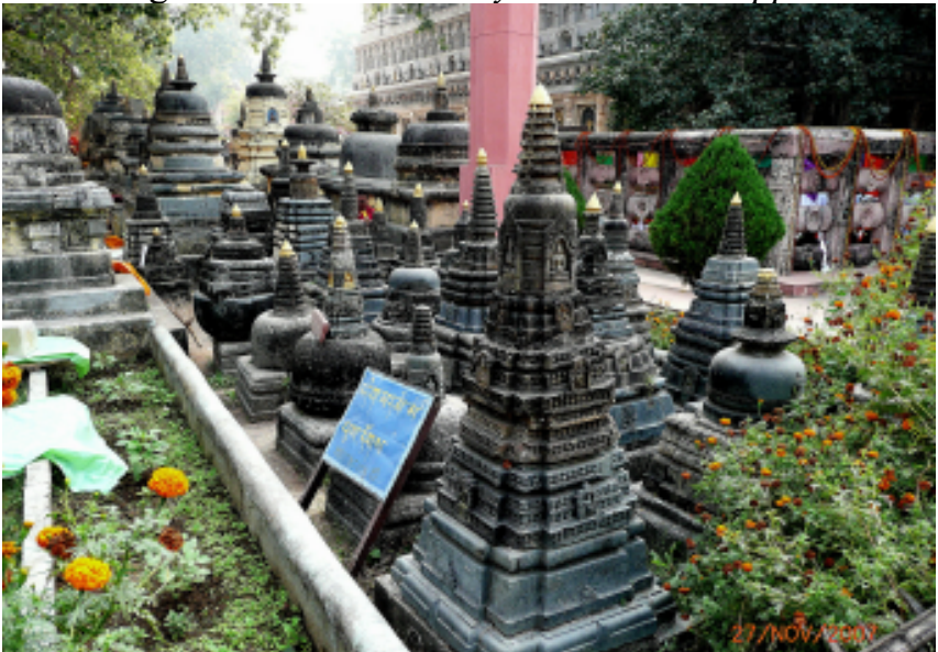
Photo 6: Many votive stupas can be seen at Bodhgaya near the Bodhi Tree. Those shown here are mostly monolithic.

Photo 5: Dhamekh stupa in Sarnath is a memorial stupa containing the Buddhist creed 'ye dhamma hetuppabhava'.