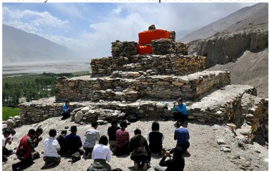
Photo 14: Stone stupa dated 6-7<sup>th</sup> century AD is situated on a cliff in Vrang village in the Wakhan Valley of Tajikistan