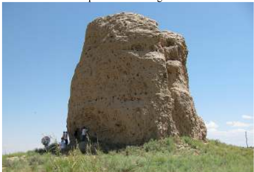
Photo 12: Zurmala Stupa in Termez, Uzbekistan at 16m tall was built during 2<sup>nd</sup> century AD under Kushan rule.

Photo 11: The Mahaparinibbana Image in Kusinara