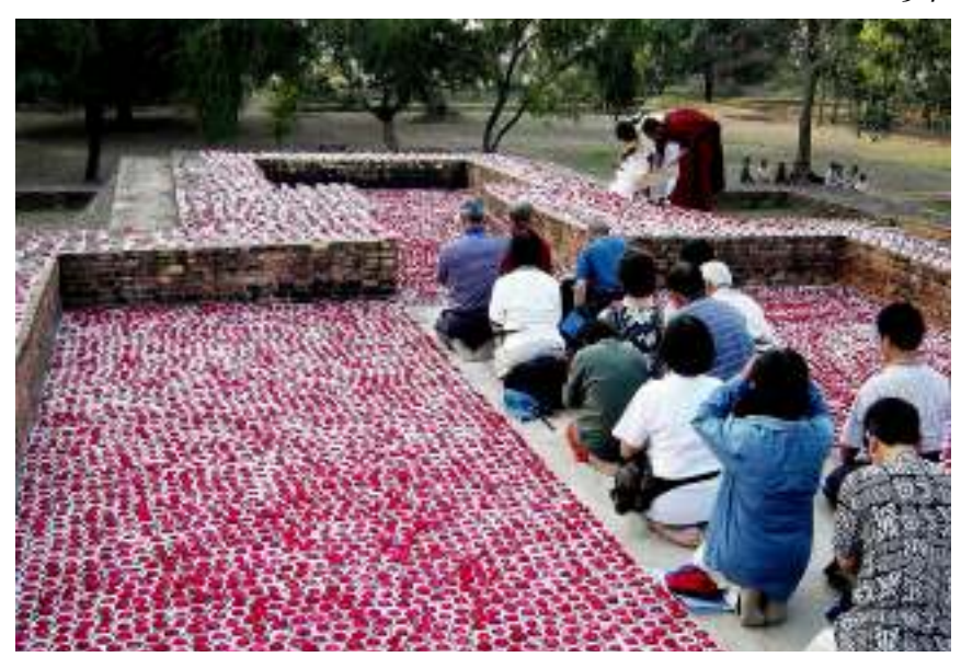
Photo 1: A famous 'shrine by use' is the Gandhakuti at Jetavana in Sravasti, where Buddha spent 19 rainy seasons.