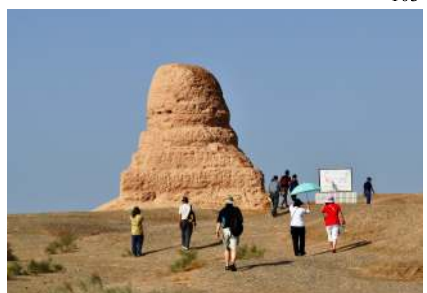
Photo 13: Mor Stupa in Kashgar, China was built during 3-4<sup>th</sup> century AD when this area was part of the Shule State.