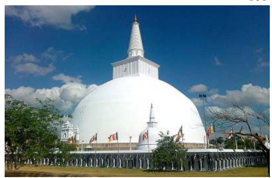
Photo 9: Ruwanweli Dagaba in Anuradhapura, Sri Lanka was built by King Dutthagamini in 137 BC.