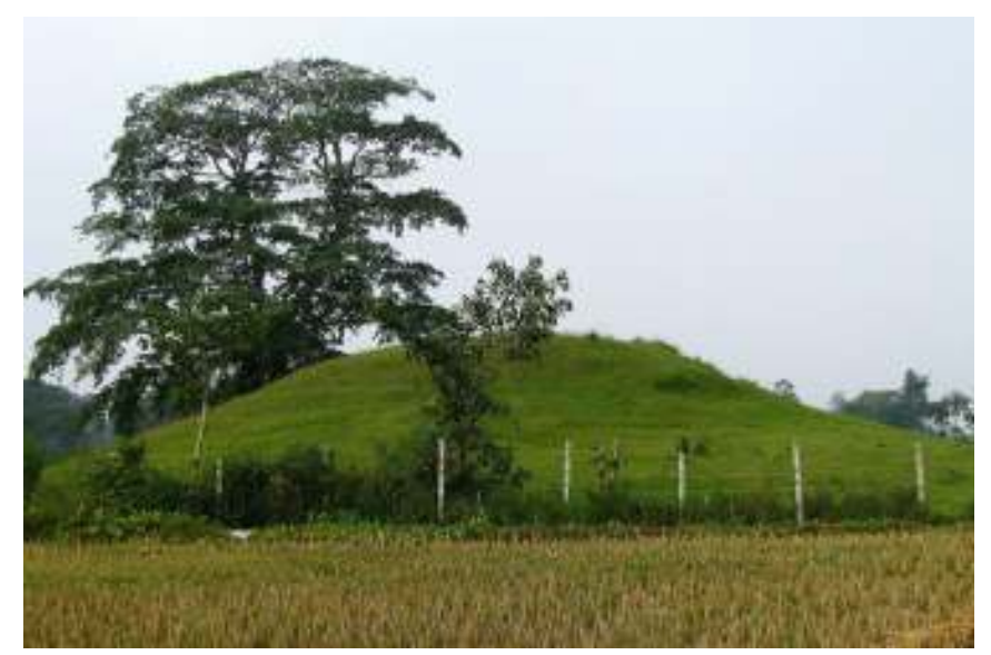
Photo 3: Stupa of Ramagama in Nawal Parasi, Nepal is the only Dona relic stupa still standing undisturbed today.