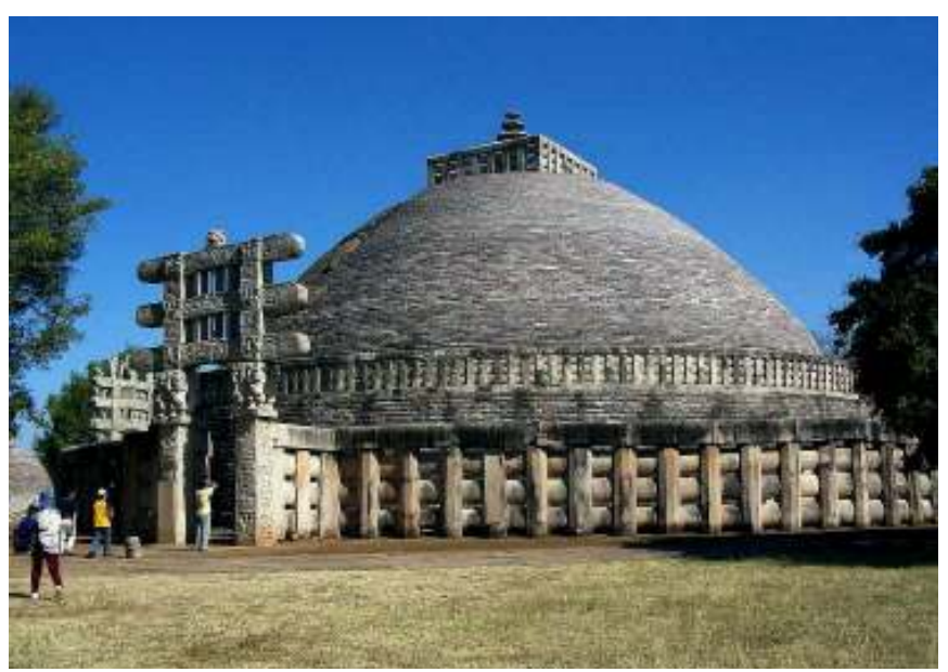
Photo 7: Great Stupa of Sanchi was erected by King Asoka during 3<sup>rd</sup> century BC to enshrine the Buddha's relics