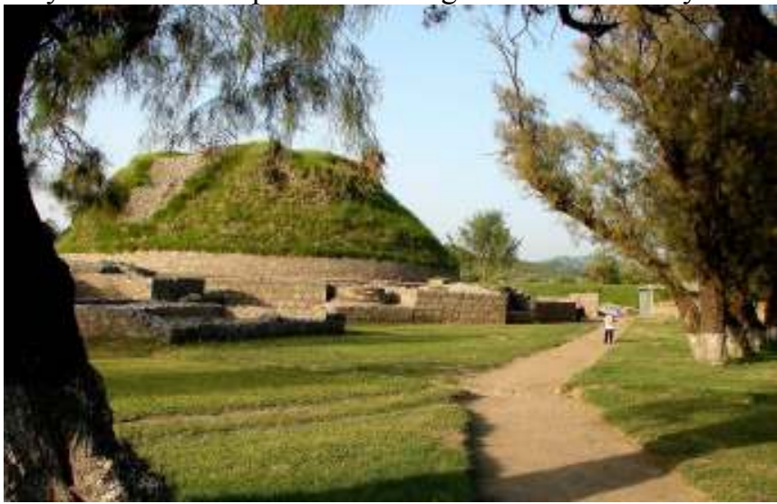
Photo 4: Dhammarajika Stupa in Taxila, was built by King Asoka in 3<sup>rd</sup> c. BC when this area was part of Gandhara.

Photo 3: Stupa of Ramagama in Nawal Parasi, Nepal is the only Dona relic stupa still standing undisturbed today.