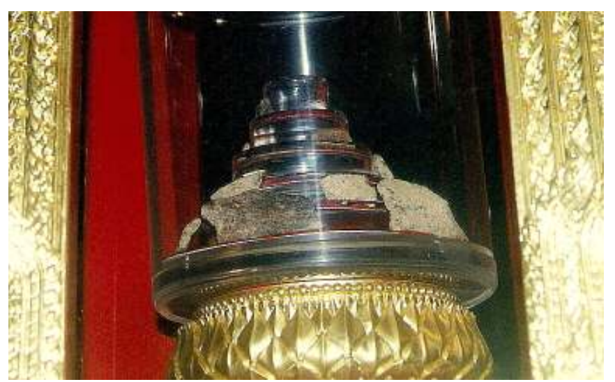
Photo 15 Two photos showing of some of the mega-size bone fragments discovered at Piprahwa stupa in 1898 and exhibited in Delhi Museum.