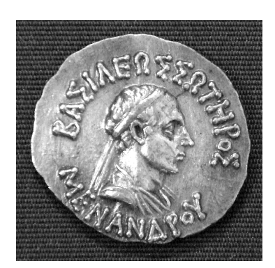
Figure 4: Silver coin of King Menander (Milinda) Reign: 165/155–130 BC

Of all Indo-Greek kings of North-western India, King Milinda is the most famous among Buddhists.