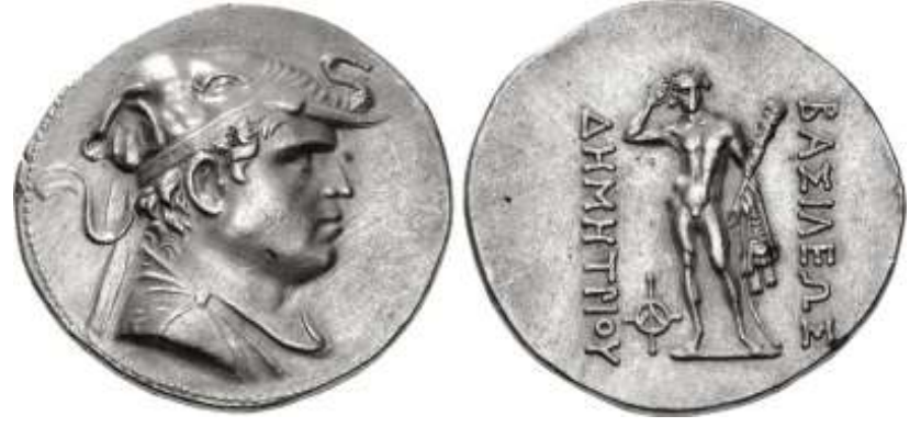
Figure 1 : Silver coin depicting Indo-Greek king Demetrius I (205–171 BC).

Obverse (Left) : Wearing an elephant scalp, symbol of his conquests in India.