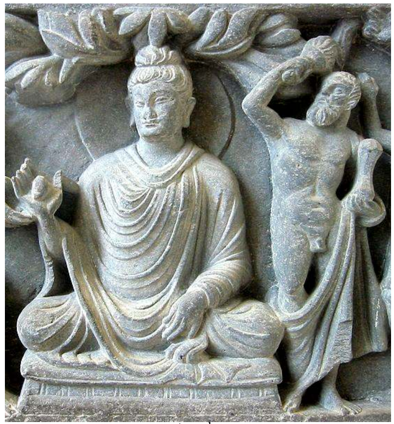
Figure 2: In this 1<sup>st</sup>-2<sup>nd</sup> century AD Gandhara sculpture from the British Museum, the Buddha is shown under the protection of the Greek god Heracles, standing with his club resting over his arm. This unusual representation of Heracles is the same as the one on reverse of Demetrius' coins. Note the resemblance of the face in the statue with that of the coin shown in Figure 1