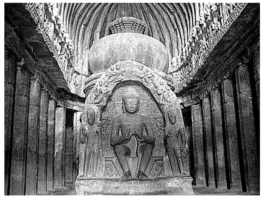
Figure 6 : Buddha image recessed at base of stupa at the Cetiya Hall of a cave in Ellora, India.

placing Holy Relics inside it. In a situation where no sacred relics are available, even verses of the Dhamma inscribed in gold, silver or copper foil or even clay, can serve the purpose. In the Ajanta and Ellora caves, we see a compromise effected by the engraving of an image on the stupa itself or recessing the image inside it as shown in the figure below.