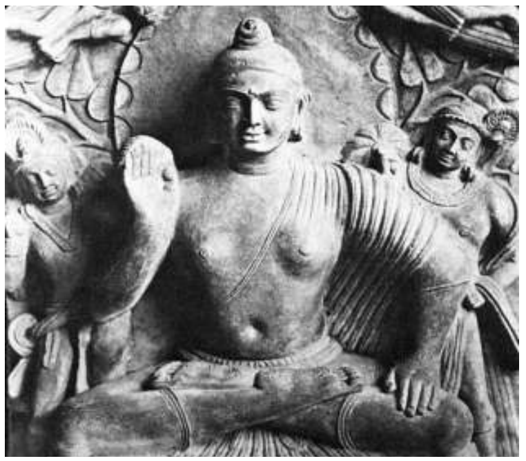
Figure 5 : Early Mathura Buddha statue showing the topknot on the head. Due to ignorance of the meaning of 'Unhisa' or turban, certain writers