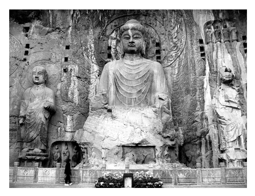
Figure 3 : Using a monarch's face as a model of the Buddha image is not unique to Indo-Greeks alone. At the Longmen Grottoes in Luoyang in Henan Province of China, stands a 17-metre tall Vairocana Buddha statue (above) with a rather feminine face. Historical records reveal that it was modeled after the face of Empress Wu Zetian, the only empress in Chinese history, who gained popular support by advocating Buddhism. She reigned during the Tang Dynasty from 690 to 705 AD. The local people also call it Empress Wu Zetian's Statue.