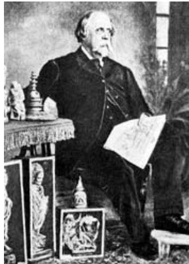
4. Gen. Alexander Cunningham, Explorer of Buddhist Heritage in India (1814-1893)