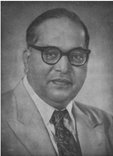
3. Babasaheb Dr. Ambedkar, Champion of Untouchables of India (1891-1956)