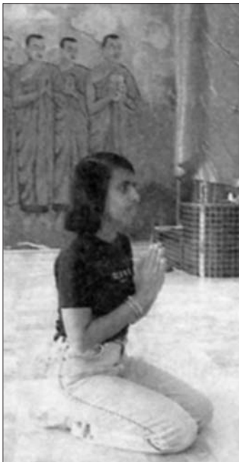
2-point reverence (both knees and toes on the floor with an añjali gesture)

Besides these three objects of veneration, Buddhists also pay respect to their Guru (teacher) and their elders (parents).