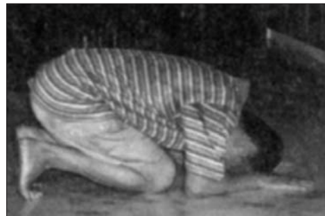
5-point reverence (both palms, elbows, knees, toes and forehead on the floor)