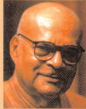
Ven. Dr. K. Sri Dhammananda